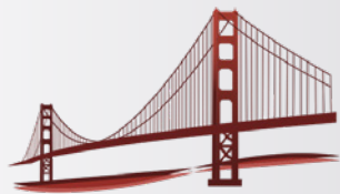
GOLDEN GATE UROLOGY, INC.